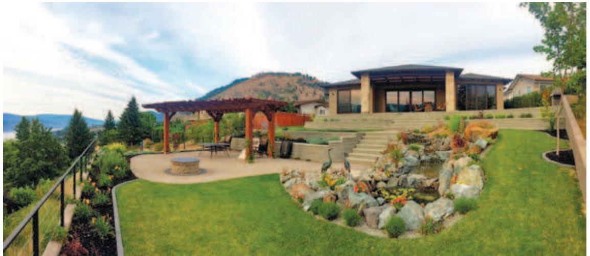
Homes constructed by Tight Lines are noted for their energy efficiency, landscaping and the general quality of the fit and finish