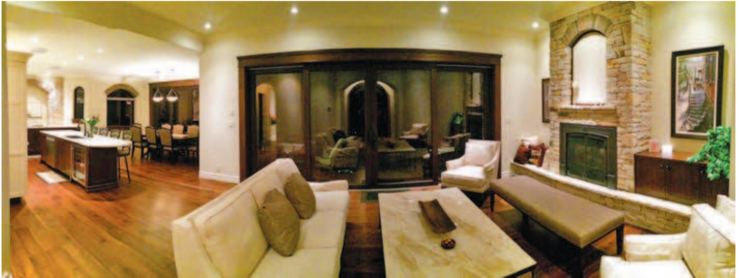
Open floor plans often factor into Tight Lines new home construction, the company has built homes all across the Summerland area