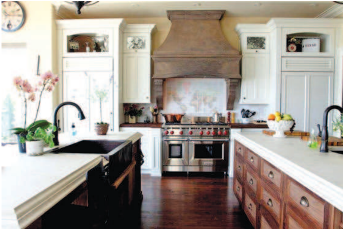
For many people the kitchen is the heart of the home, and a project completed by Tight Lines will include high end appliances